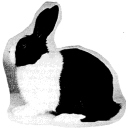
FIGURE 1 A copper-deficient rabbit, showing a graying of genetically black hair. There later develops a severe anemia (S. E. Smith, Cornell University).