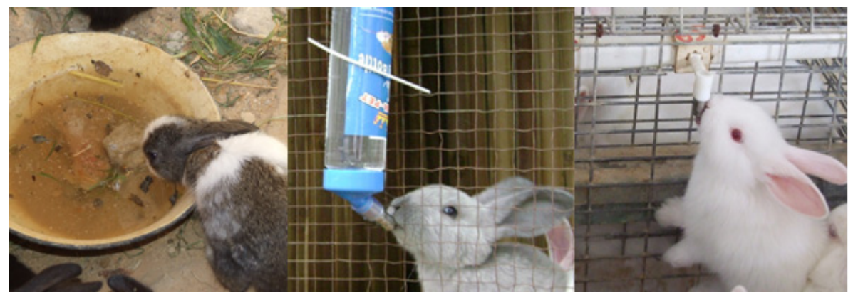
Figure 2: For example it is generally well-advised to change watering in a plate to a semi-automatic or automatic watering system providing clean water to rabbits