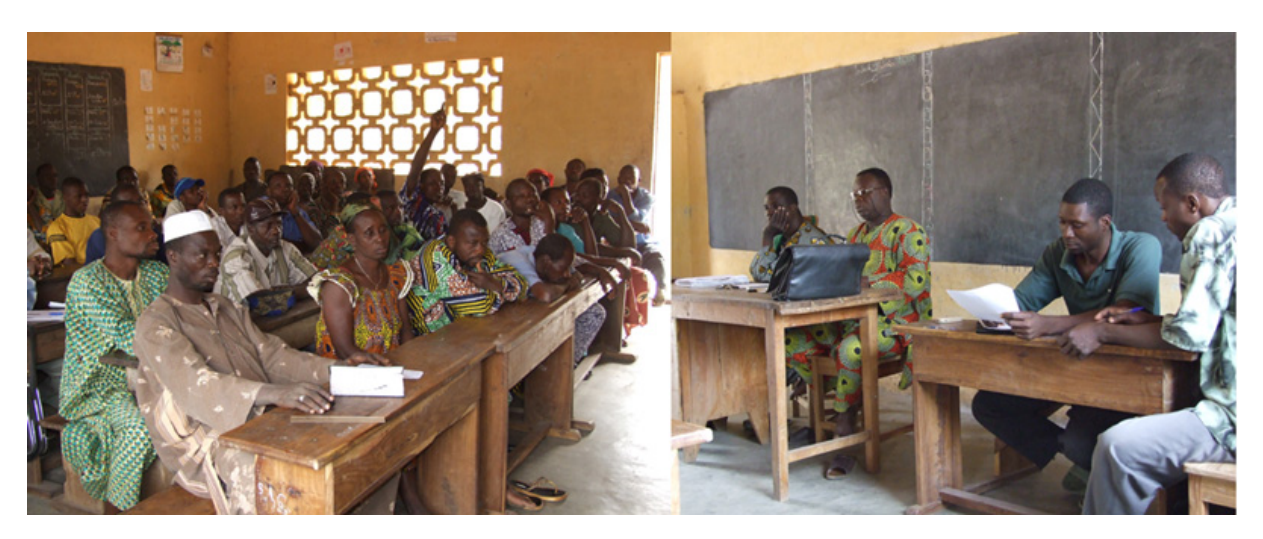
figure 1: The farmers must have frequent meetings to exchange information